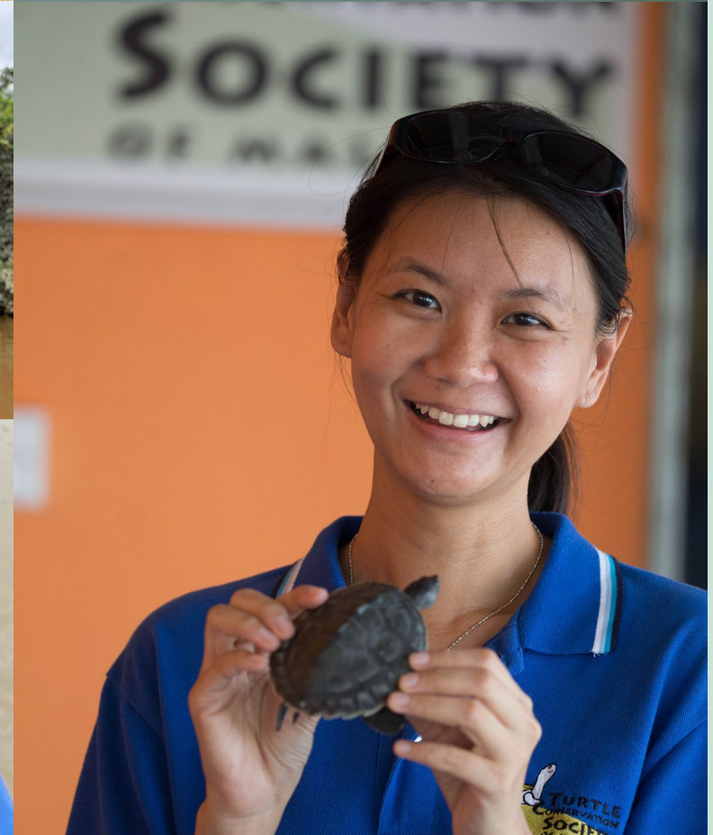
Top right image © Thida Leiper/WCS. All other images © Turtle Conservation Society of Malaysia